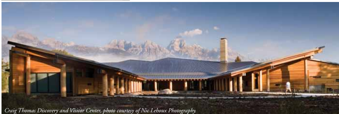
Craig Thomas Discovery and Visitor Center

Entries are due on Friday, July 9, 2010 . Awards will be presented in October at the NCSEA Annual Meeting at the Hyatt Regency on the Hudson, Jersey City, New Jersey. Winning projects will be featured in future issues of STRUCTURE magazine. For award program rules, project eligibility and entry forms, see the Call for Entries on the NCSEA website at www.ncsea.com .